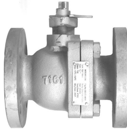
Product Code BD02