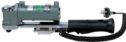
ACLS100N High provisional with limit switch type