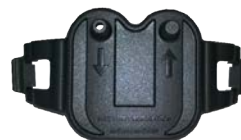
Aspirator plate Sample atmosphere prior to entry