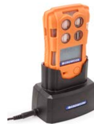
Cradle charger Docking station for easy charging