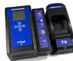
I-Test Easy automated bump testing and calibration solution