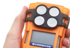
External filter plate Clip-on filter for dusty environments