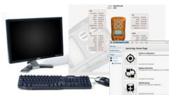
NEW Portables Pro 2.0 Software For easy configuration and servicing