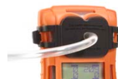
Bump/calibration plate To apply test gas to T4