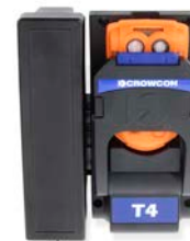
Vehicle charger Effective charging and storage whilst travelling