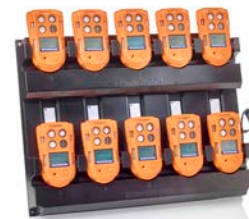
10 way charger For charging and storing your T4 fleet