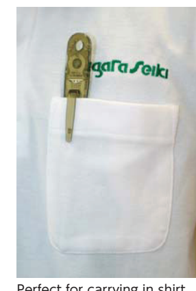
Perfect for carrying in shirt pocket