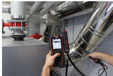
Hygrometry and air velocity measurement