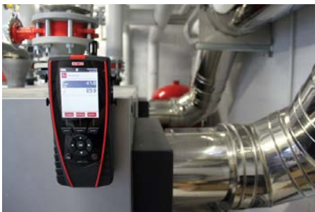
Climatic conditions measurement

AMI 310 PRF : portable instrument supplied with a ±500 Pa pressure module, a Ø6 mm T Pitot tube, 2 x 1 m of silicone tube, a stainless steel tip, a wireless stainless steel hygrometry probe, a telescopic hotwire probe and a Ø100 mm vane probe