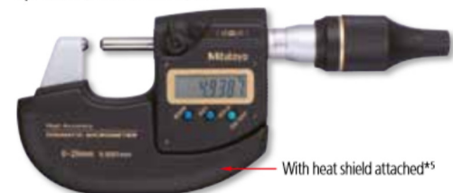
With heat shield attached*5

Heat shield (No. 04AAB969A: 293-100 No. 04AAB969B: 293-130) x 1 Lithium battery (CR2032) x 1 Spanner (No. 200877) x 1