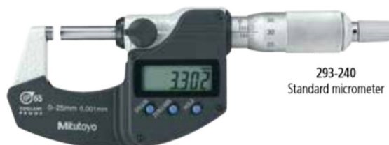
293-240 Standard micrometer

Comparative sizes: High Accuracy-Micrometer with a highly rigid frame and a common Micrometer with a standard frame