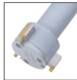
TiN coated contact points (" -10" suffix models only)