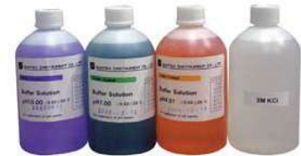
Standard buffer, 500ml