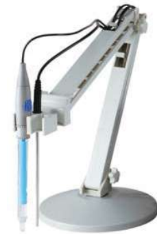
Flexible electrode holder with pH and temp. probe