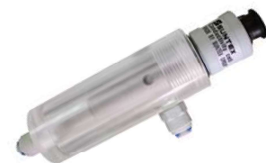
Resistivity probe with bypass chamber