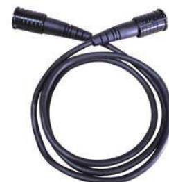
Cable for resistivity probe