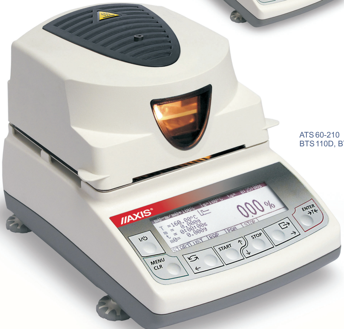
ATS 60-210 BTS 110D, BTS 110