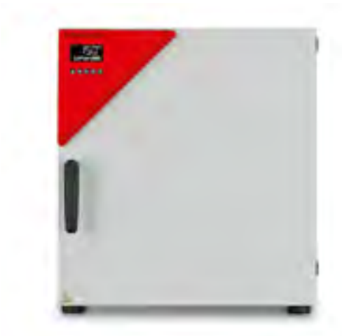
FD 56 model

A BINDER FD series Avantgarde.Line heating oven is always used when fast drying and sterilization is required. Thanks to its fully homogeneous temperature distribution, quick dynamics and powerful fan, this heating oven saves valuable time.