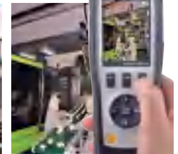
JPG images/AVI videos