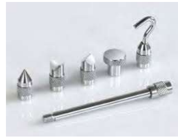
(Included with Attachment)