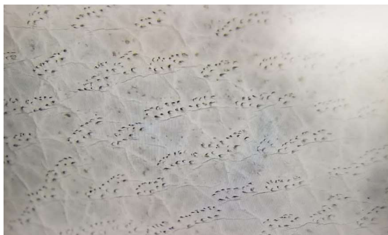
Figure 1.3: Sheep Skin Texture (Real Image Capture)