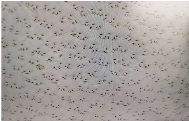
Figure 1.2: Goat Skin Texture (Real Image Capture)