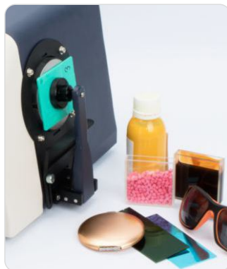
Liquid, Powder, Solid Sample Measurement

Transmittance Measurement: Adopt D/0^\circ Geometry, conform to ISO, CIE, ASTM and DIN standard.