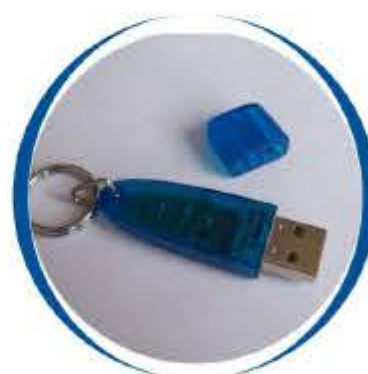
USB加密狗 USB Sofeware Dog

For reduce defective goods, this celluar platform have a sorption function which can make the materials level off. Meantime, this platform can release material dust automatically.