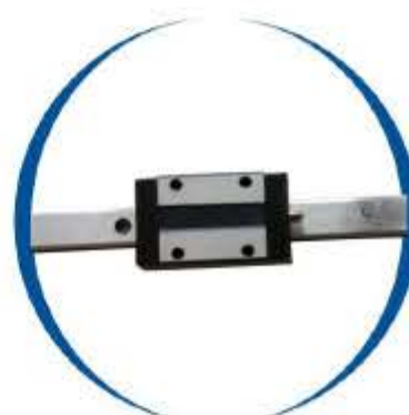
AMT 导轨 AMT track

The lens is exported from Singapore, which have minute facula and werable function. The Working life is triplicate of homemade lens.