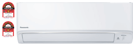
CS-XPU10XKH-1 | CS-XPU13XKH-1