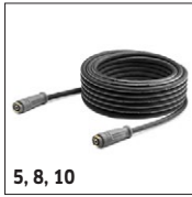
5, 8, 10