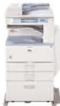
MP 2550SPF/MP 3350SPF

For exceptional black & white printing and color and black & white scanning.