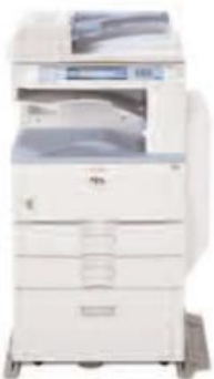
MP 2550B/MP 3350B