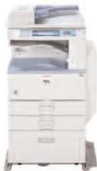
MP 2550SP/MP 3350SP

For robust copying and a flexible upgrade path to black & white scanning, printing and faxing.