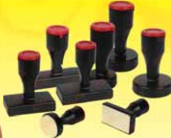
Normal Rubber Stamp