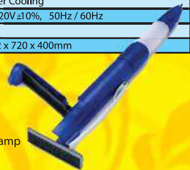
Pen Rubber Stamp

All specification above are subject to change without prior notice.