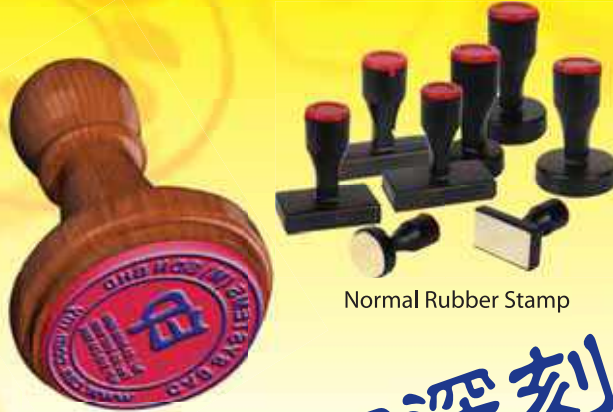
Normal Rubber Stamp