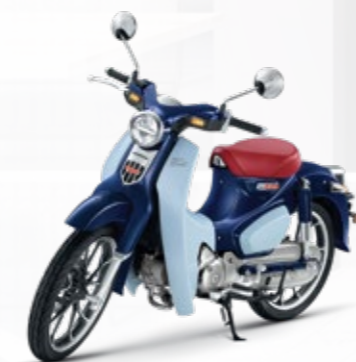
Pearl Niltava Blue