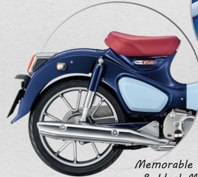
Memorable Single Pillion & Ideal Metal Fender