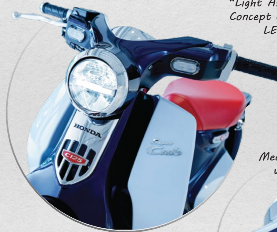
"Light As Wing" Handlebar Concept & Classic Rounded LED Headlight