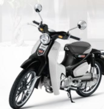
Pearl Shining Black