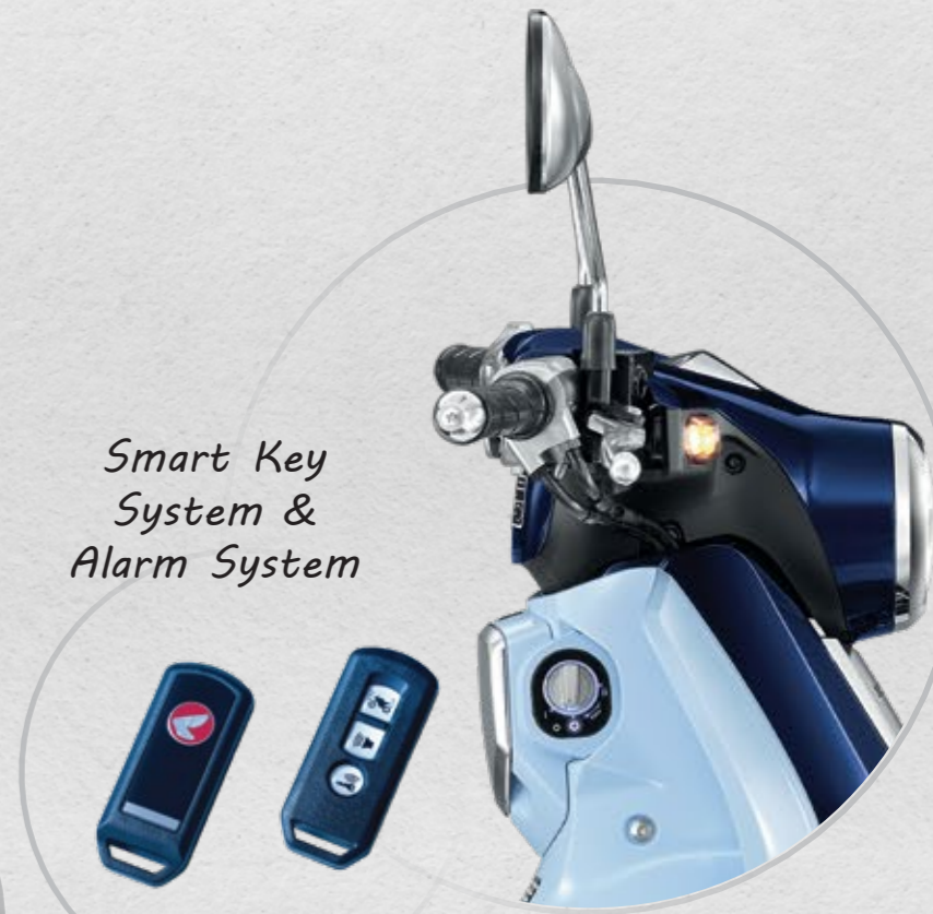
Smart Key System & Alarm System