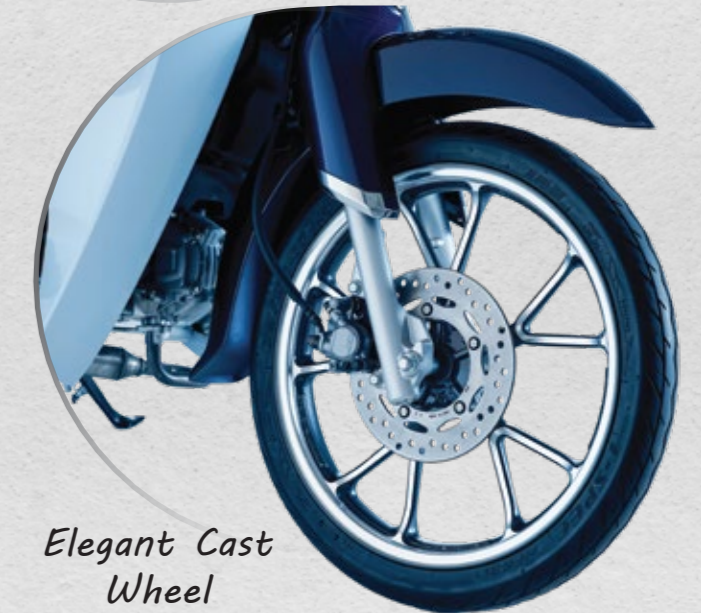
Elegant Cast Wheel