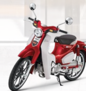
Pearl Nebula Red