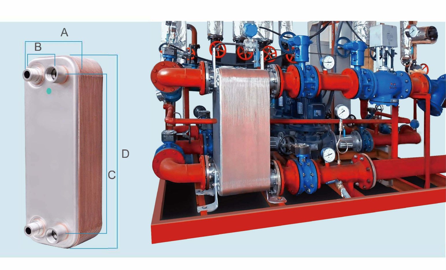
Plate material: AISI316L/304 Connection material: AISI304 Brazing material: Copper Max design temperature: 225 °C Min design temperature: -196 °C Max design pressure: 45barg