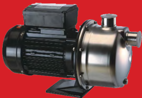
S/STEEL SELF-PRIMING PUMPS