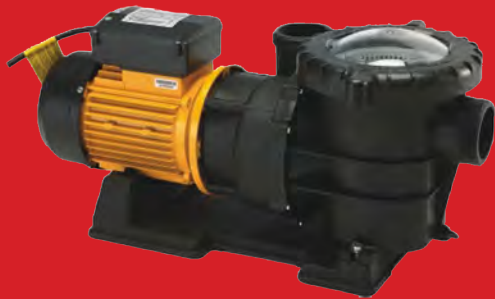
BATHTUB/SWIMMING POOL PUMPS