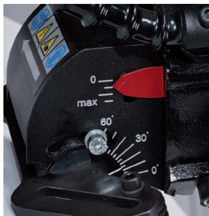
Continuous angle adjustment from 0 to 60 degrees.