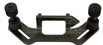
Optional guide for pipes Ø 260-600mm (10-24") Product code: PRW-0461-22-00-0