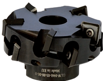
Mono block milling head, with 10 indexable inserts fixed with screws. Product code: GLW-0461-03-00-00-0