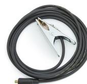
Earth return cable 5 m, 35 mm 2