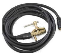
Earth return cable 5 m, 50 mm 2