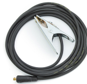
Earth return cable 5 m, 16 mm 2