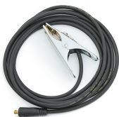
Earth return cable 10 m, 25 mm 2