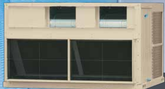
UATN120/150/ 210/240/ 300CGY1X