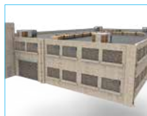
Factory / Warehouse