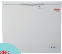
Model: ACF 20G Capacity: 197 litres