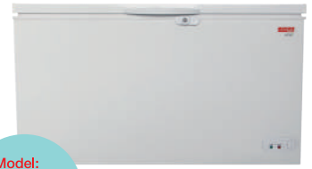
Model: ACF 60G Capacity: 560 litres