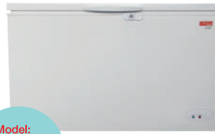
Model: ACF 50G Capacity: 459 litres