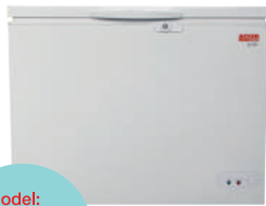
Model: ACF 30G Capacity: 283 litres