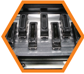
Individual Print Head Capping