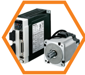
Panasonic AC Servo Motor