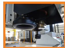
Optional add-on CCD Crop Mark Detect for Print & Cut