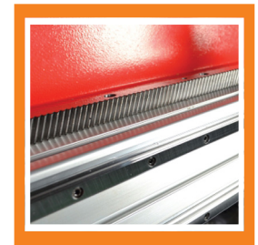
Precision Rack Drive