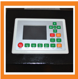
Easy Operate Panel