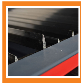
Solid Aluminium Strip