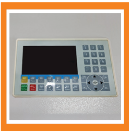
Easy Operate Panel