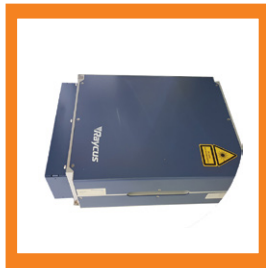
Laser Power Supply