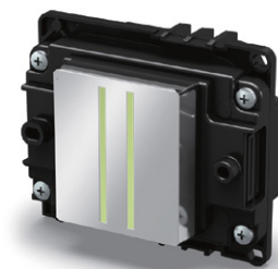
New i1600-U1 EPSON most advanced print head PRECISIONCORE