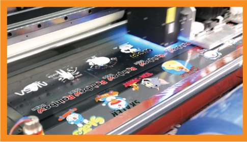
Print (UV DTF Film)