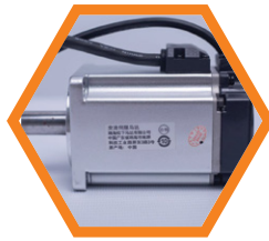
AC Servo Motor