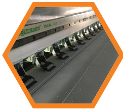
Low Noise Linear Bearing