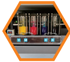
Electric Glass Cartridge