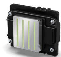
i3200-U1HD EPSON most advanced print head PRECISIONCORE