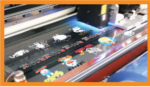
Print (UV DTF Film)