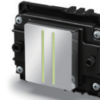
i1600-U1 EPSON most advanced print head PRECISIONCORE