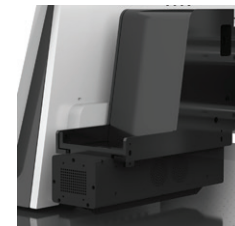
Visual Positioning Device