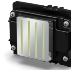
i3200-U1/U1HD EPSON most advanced print head PRECISIONCORE