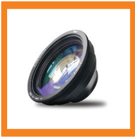
Famous Brand Lens