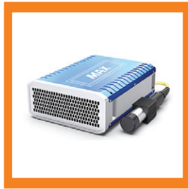
Laser Power Supply