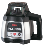
Automatic Rotating Laser