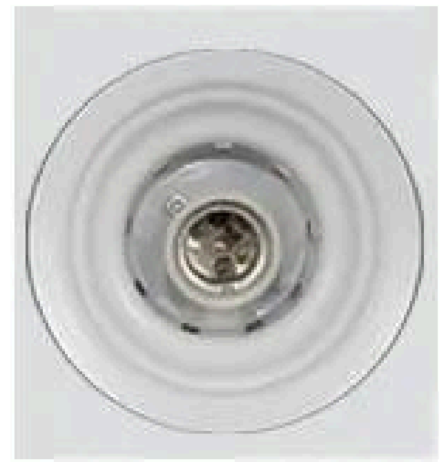
HIGH QUALITY LAMP HOLDER It is not difficult to disassemble and assemble