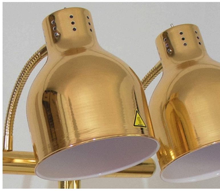
BEAUTIFUL MIRROR ALL STEEL All-match restaurant environment