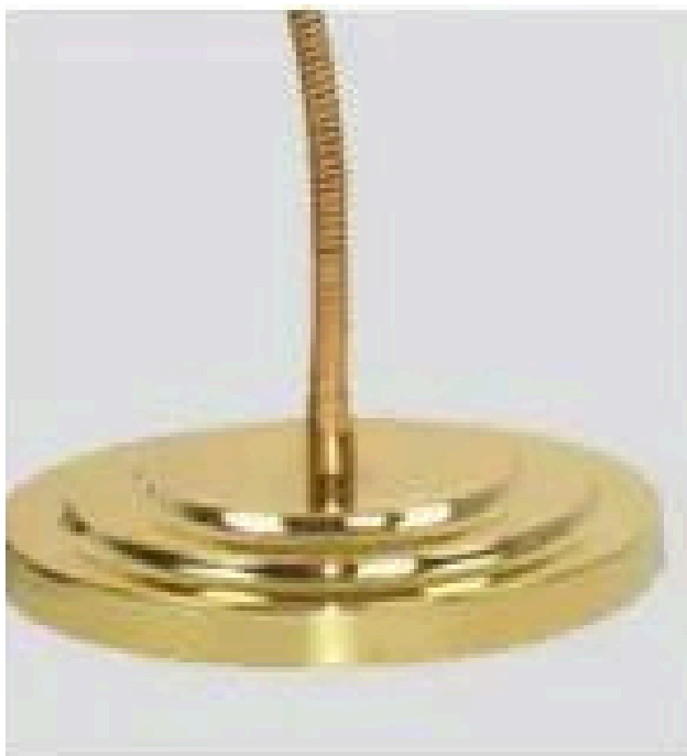
WEIGHTED BASE Security does not tilt