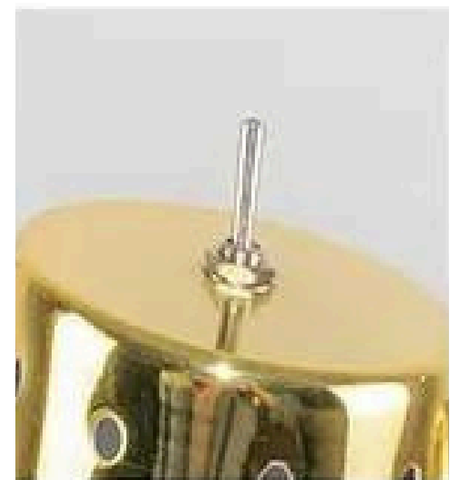
ONE-BUTTON ROCKER SWITCH Safe and convenient atmosphere