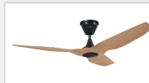
CARAMEL (WITHOUT LIGHT KIT)