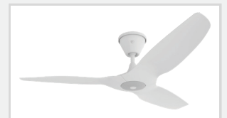
WH/WH (WITH LIGHT KIT)