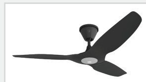
BK/BK (WITH LIGHT KIT)