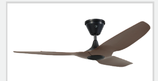
COCOA (WITHOUT LIGHT KIT)