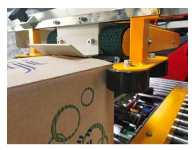
Guidance Wheel (Fixed Position)

Carton position is fixed while conveying the box