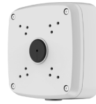
PFA121 Junction box