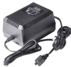
TEAC-66-243000V (EU) MKAC-66-243000U (USA) TEAC-66-243000VB (UK) Power adapter (for outdoor model)