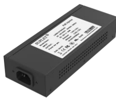
LAS60-57CN-RJ45 Hi-PoE Midspan