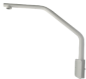
DS-1660ZJ Parapet Mount