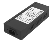
LAS60-57CN-RJ45 Hi-PoE midspan