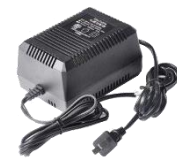
TEAC-66-243000V (EU) MKAC-66-243000U (USA) TEAC-66-243000VB (UK) Power adapter