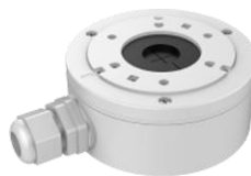
DS-1258ZJ Junction Box