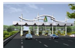
Highway Toll Station