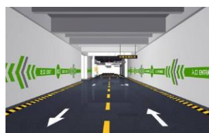
Entrance & Exit