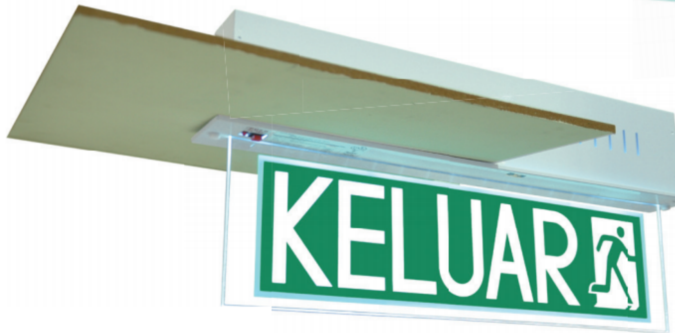
PEX-138R-LED Recess Mount