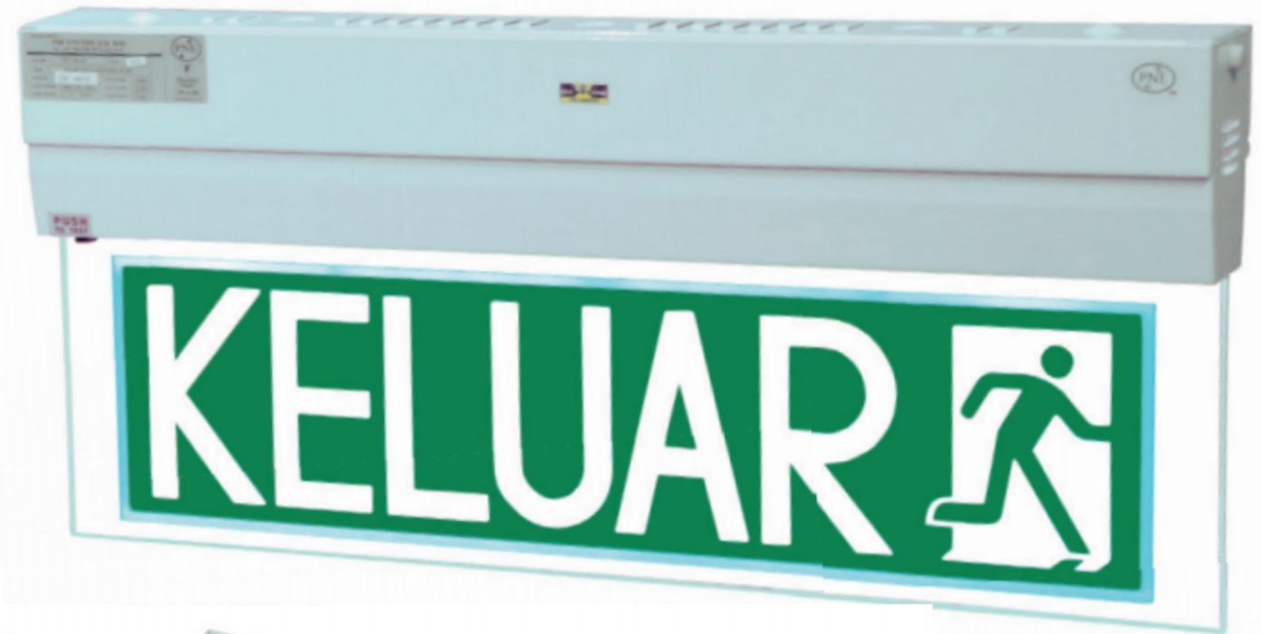
PEX-138-LED Surface Mount