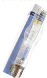
400W MH TUBE