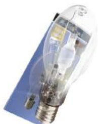
250W MH BULB