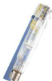
1000W MH TUBE