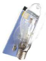
150W MH BULB