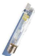
250W MH TUBE