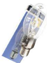
400W MH BULB